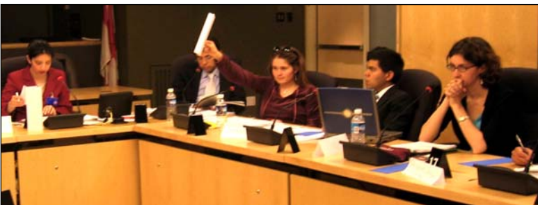
Legislators at work in a political commission