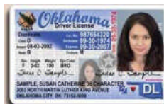
Driver's License with Facial Recognition Biometrics