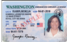
Enhanced Driver's License - Facial Recognition - RFID chip – used as a DL/ID-passport for border-states