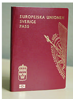
EU e-Passport with biometrics, RFID chip and ICAO biometric e-Passport Logo