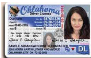
Driver’s License with Facial Recognition Biometrics