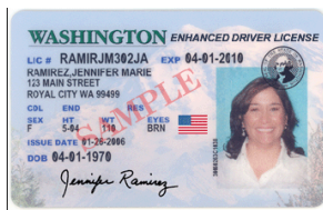
Enhanced Driver’s License - Facial Recognition - RFID chip – used as a DL/ID-passport for border-states