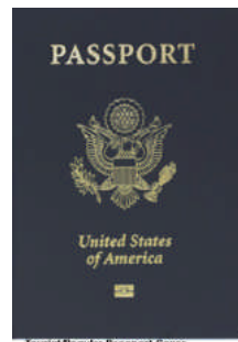
ICAO’s Biometric ePASSPORT, with RFID chip used by EU, U.S. & all Visa Waiver nations

DHS - The driver’s license is the most powerful document we have, controlling our ability to buy, sell and travel. Federal agencies want this power but must first dismantle states’ rights, protected by the Constitution. DHS and other agencies, already have “legal” access to state database records under the “Driver Privacy Protection Act of 1994” (DPPA). However, before wholesale access can occur, states must adopt common document and biometric standards, storing and sharing significant personal-biometric data.