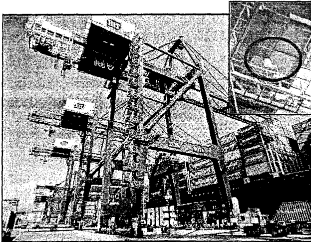
Figure 1. SaviTrak reader infrastructure on a quay crane in HIT terminal, Hong Kong.

The readers connect to a Site Manager, a PC-like piece of hardware usually housed in a host facility's computer room. This Site Manager communicates via the Internet (outside of the LAN firewall) with the SaviTrak Network Operating Centers.