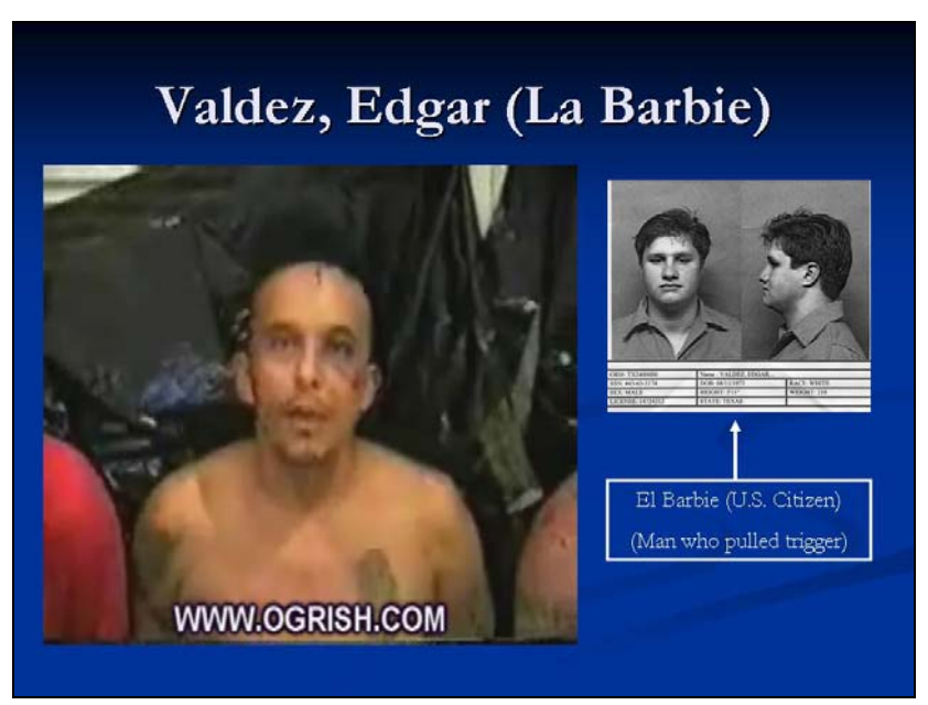
"La Barbie," head of the Sinaloa enforcers alleged to have killed members of Zetas

camera captor. Law enforcement authorities have never found the body of the murdered Zeta, nor the other three men, dead or alive.<sup>25</sup>