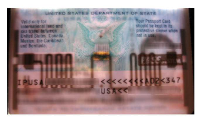
Figure 3: The antenna inside a Passport Card. Certain personally-identifiable information has been obscured.

The experiment we conducted was done in a very noisy environment, consisted of multiple readers interfering with each each other giving very inconsistent readings (Figure 1). Setup was fairly simple. We had a single tag that was being probed in clear line of sight. Our first goal was to determine if there was any meaning that could be extracted from these erratic readings. Given the setup above, we took n number of readings and recorded those values. Afterward we kept on shifting the tag few centimeters at a time and recording those values as well. The results were as following. Taking the average of values for each of the measurements reveled interesting results. We were able to effectively determine relative distance based on the averaged RSSI readings.