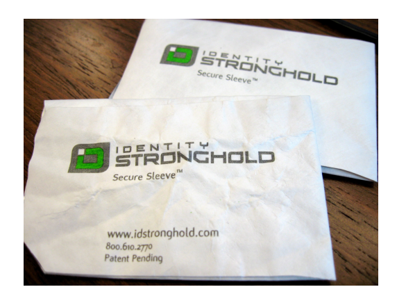
Figure 1: The sleeves used for our shielded distance tests. The crumpled sleeve is in the foreground, with the new sleeve behind it.

able operational range of tens of feet [39], read ranges can vary considerably as a function of the material to which a tag is affixed, the configuration of the interrogating reader, and the physical characteristics of the ambient scanning environment.