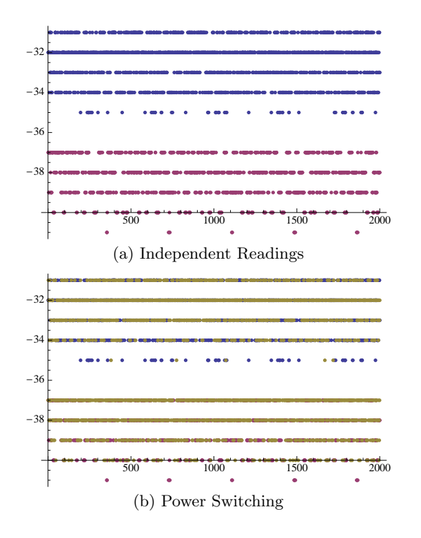
Figure 4: Blue - 32dB, Red - 16dB, Yellow - Switched

Even though, the measurements were very consistent, with low standard deviation gave us little insight in if the power calibration was actually finished within the hardware. In order to verify this, we had to come up with a new scheme. The only difference in the pseudo code from the above is that the power level would alternate from low to high power setting and whenever the power setting was altered we read exactly one RFID tag and recorded its RSSI value. In other words, making two different measurements with opposite power levels with no overlapping values should not differentiate from scheme above where we keep on alternating the power level. Here is the graph representing the results.